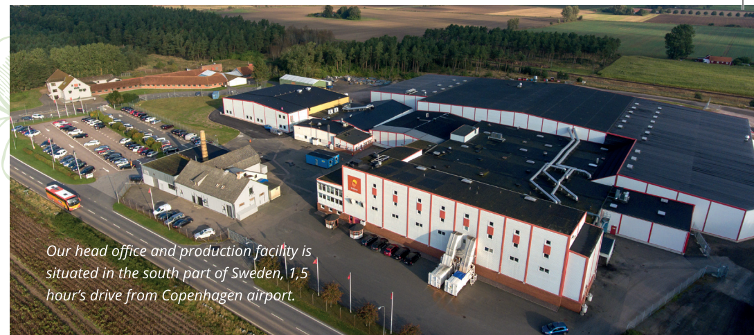
Our head office and production facility is situated in the south part of Sweden, 1,5 hour's drive from Copenhagen airport.