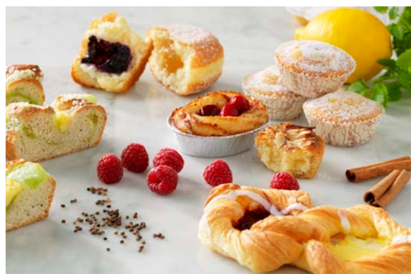
Culinax offers even and slow release flavours with an outstanding stability to baked products.

This is why the Culinax® flavours make the impossible possible for the food industry!